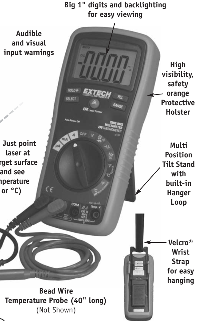
CAT III Test Leads (54" long)