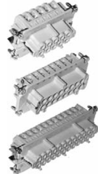
Plastic Male Insert, With Pin Contacts