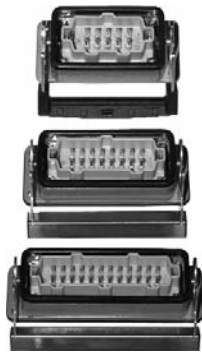
Male Mold Thermocouple Connector