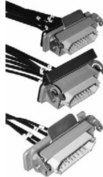
Male Housing Thermocouple Connector