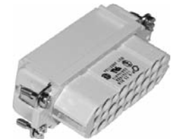
Plastic Male Insert, No Pins