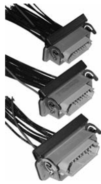
Male Mold Heater Connector