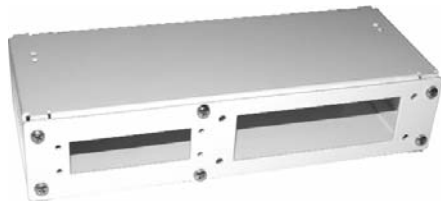
Mounting Box (Thermocouple & Power)