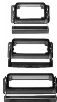
Male Metal Panel Mounting Base with Gasket for Heaters & Connectors