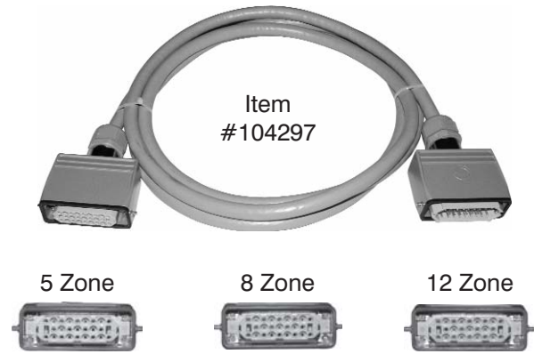
Mold Power Cable 15 Amp