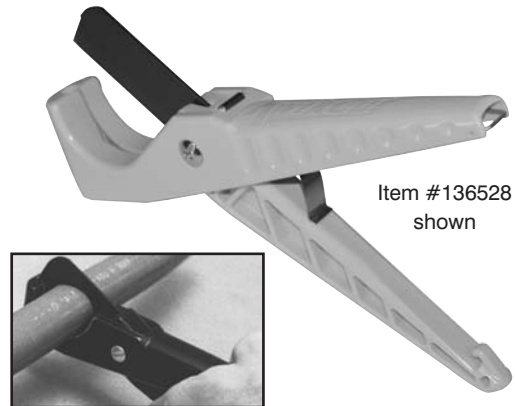
Item #136528 shown