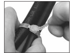
3. To Lock: Pull end up to lock in place. To Release: Pull end of strap out and then down.