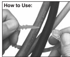
1. Loop around hoses to be tied.