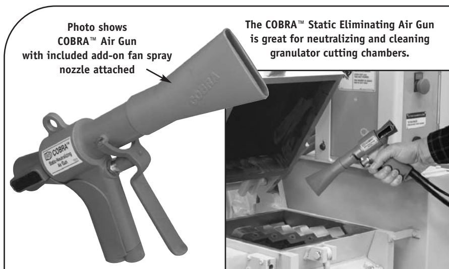
Photo shows COBRA™ Air Gun with included add-on fan spray nozzle attached

To minimize air consumption, the COBRA™ uses airflow amplification to induce surrounding room air through the gun at a 3:1 ratio.