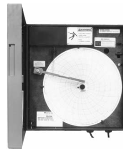
Precision crafted by Honeywell, Inc.