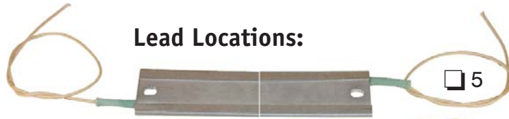
(Mica: 3/4" MIN Width) (Ceramic: 1" MIN Width)